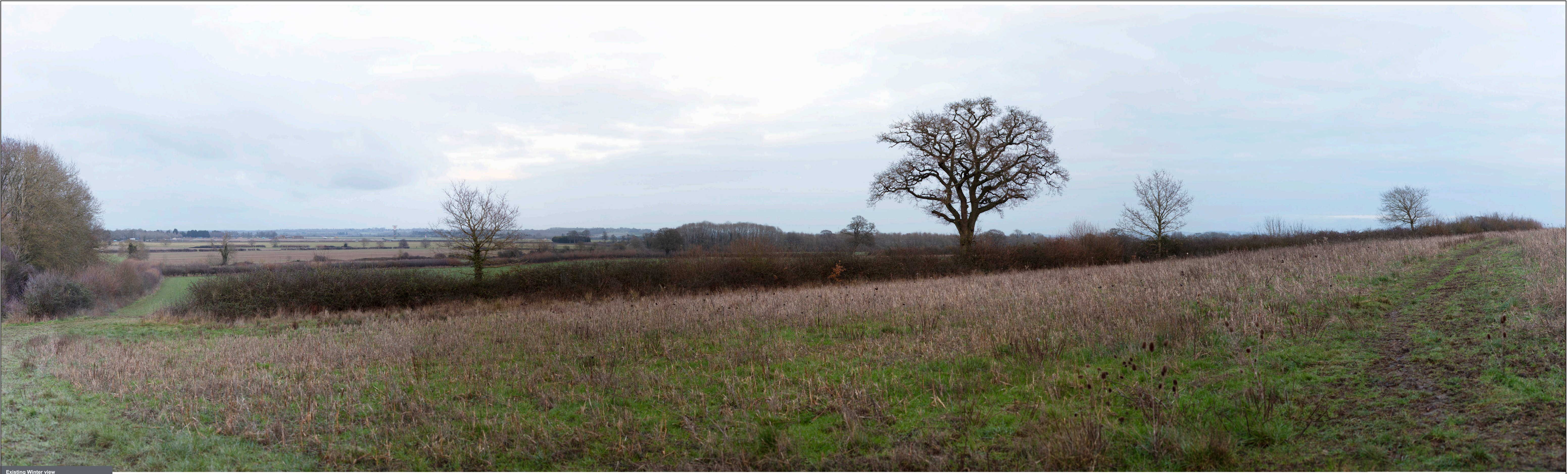
Existing Winter view