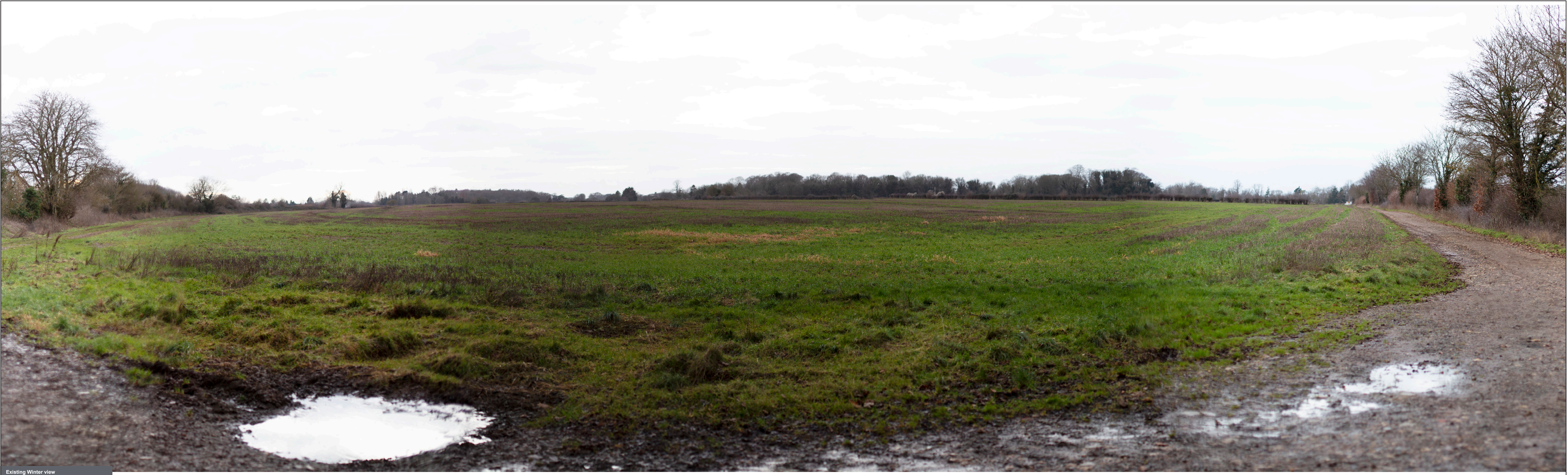
Existing Winter view