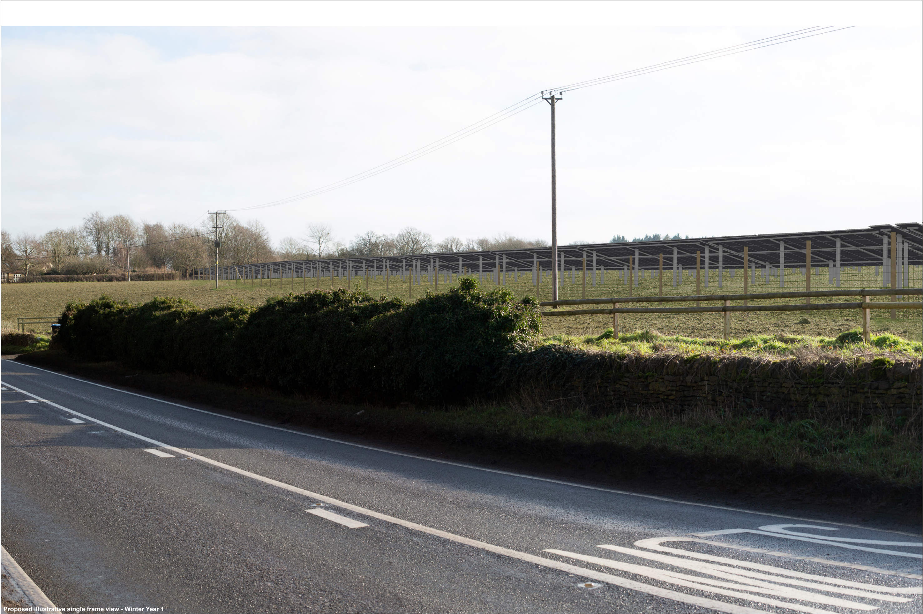
Proposed illustrative single frame view - Winter Year 1