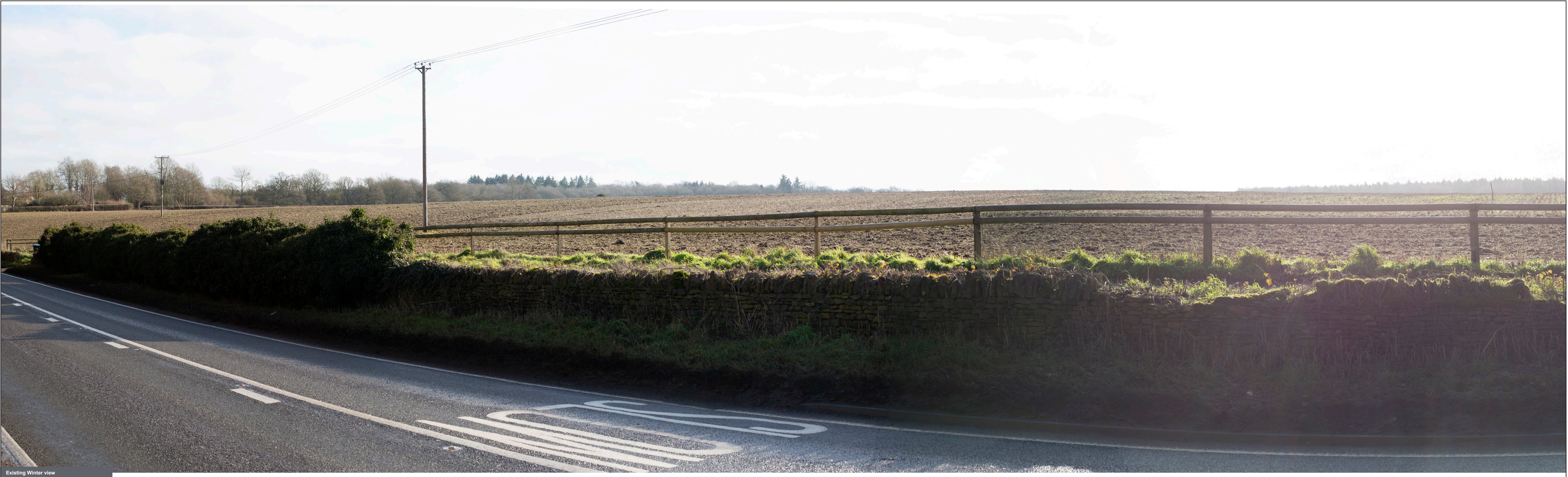
Existing Winter view