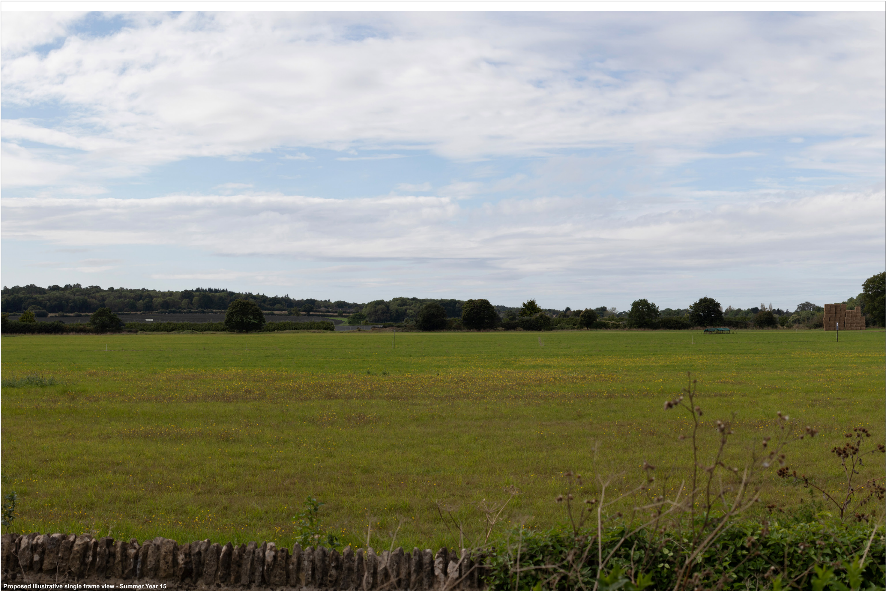
Proposed illustrative single frame view - Summer Year 15