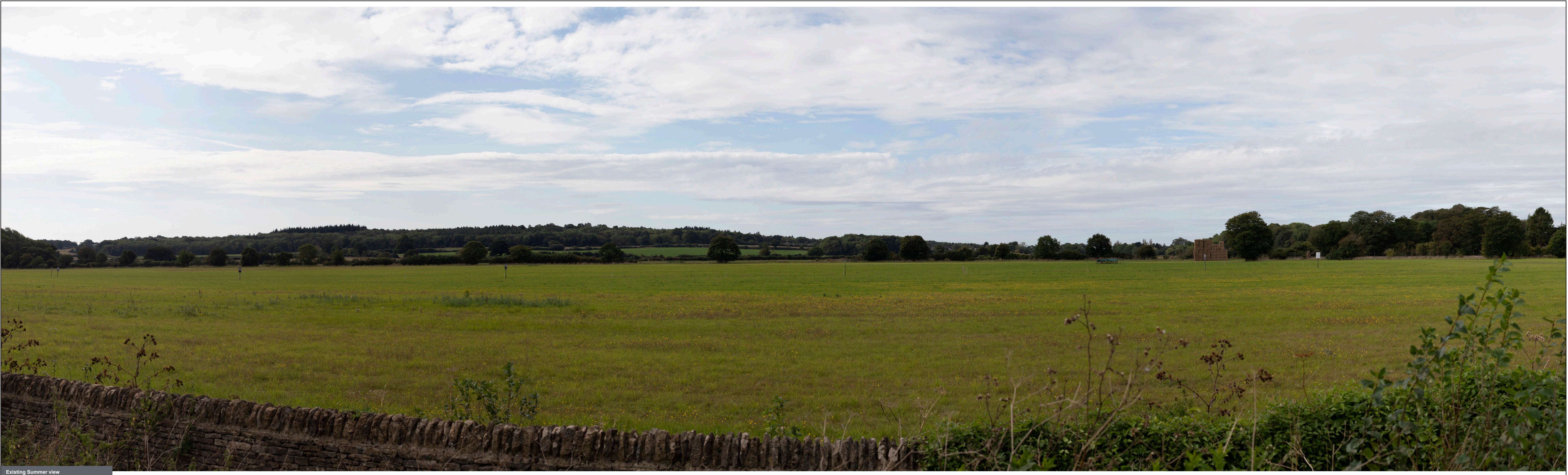
Existing Summer view