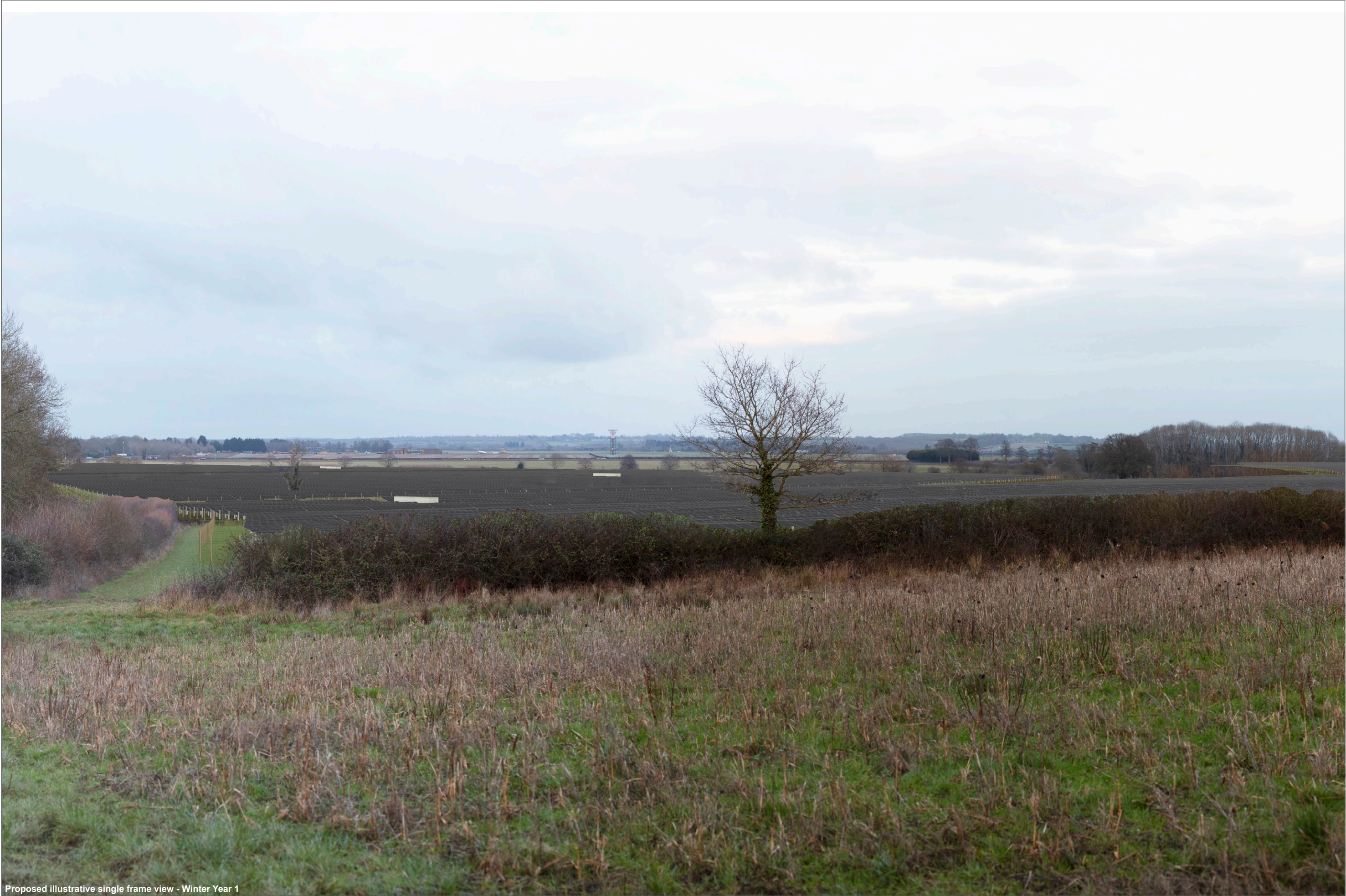
Proposed illustrative single frame view - Winter Year 1