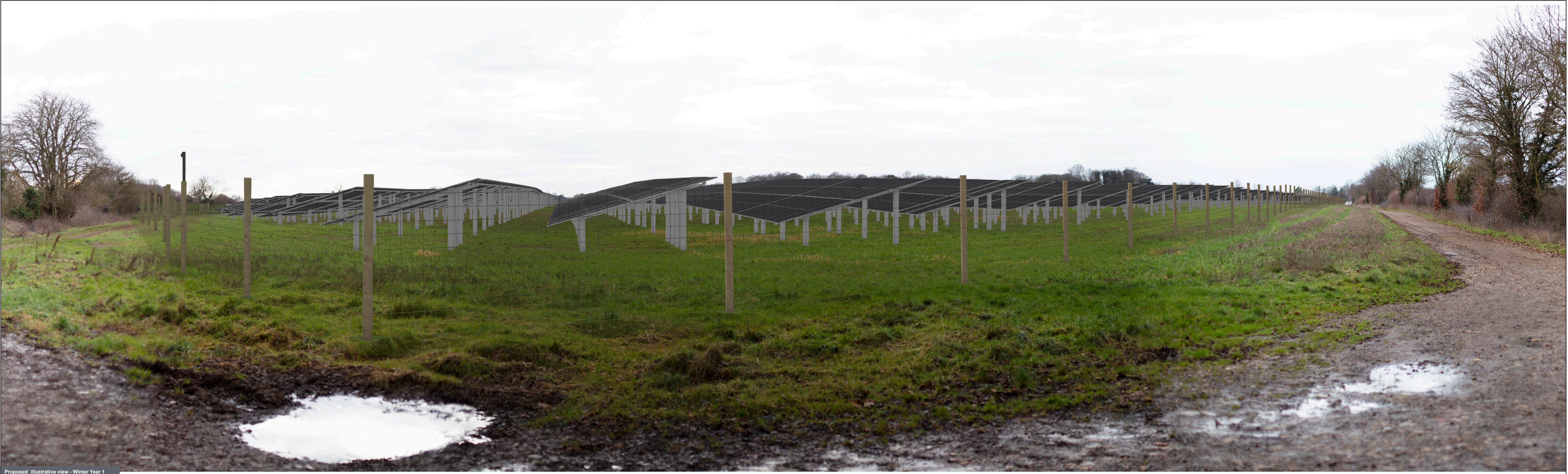
Proposed illustrative view - Winter Year 1