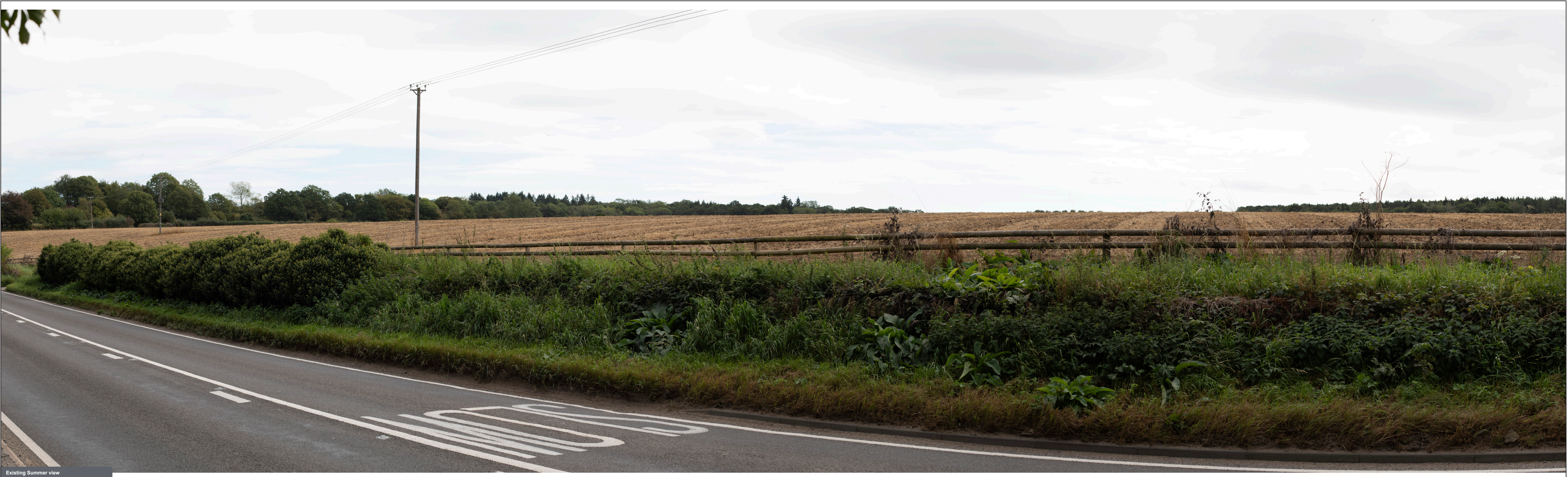
Existing Summer view