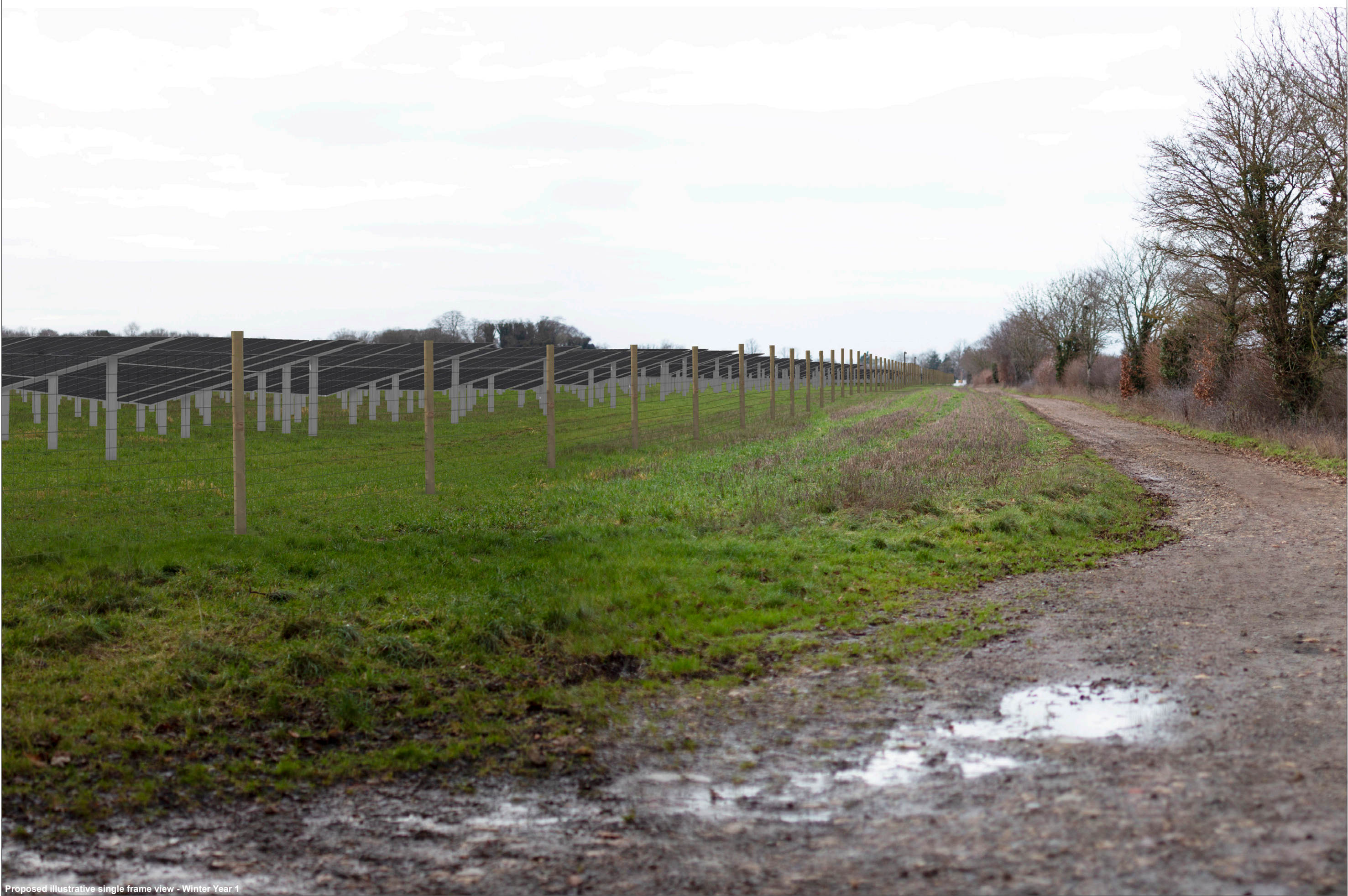
Proposed illustrative single frame view - Winter Year 1