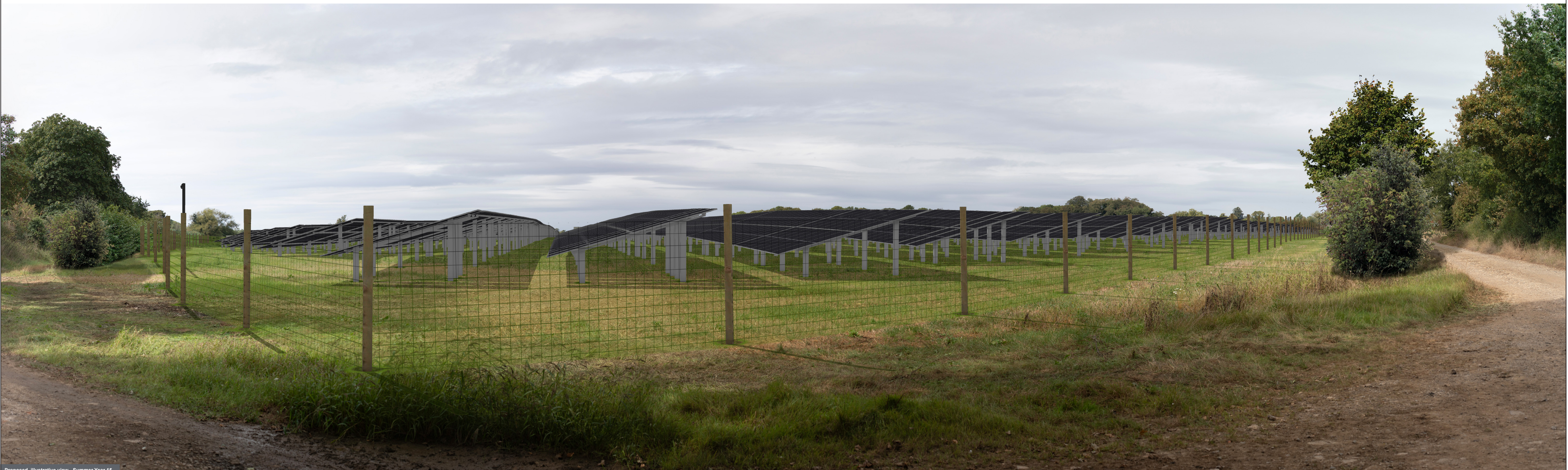
Proposed illustrative view - Summer Year 15