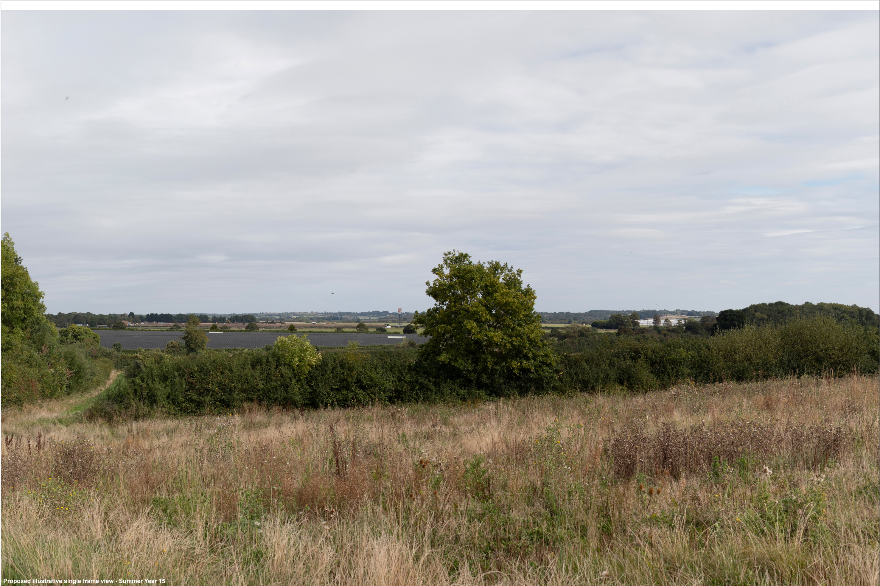
Proposed illustrative single frame view - Summer Year 15