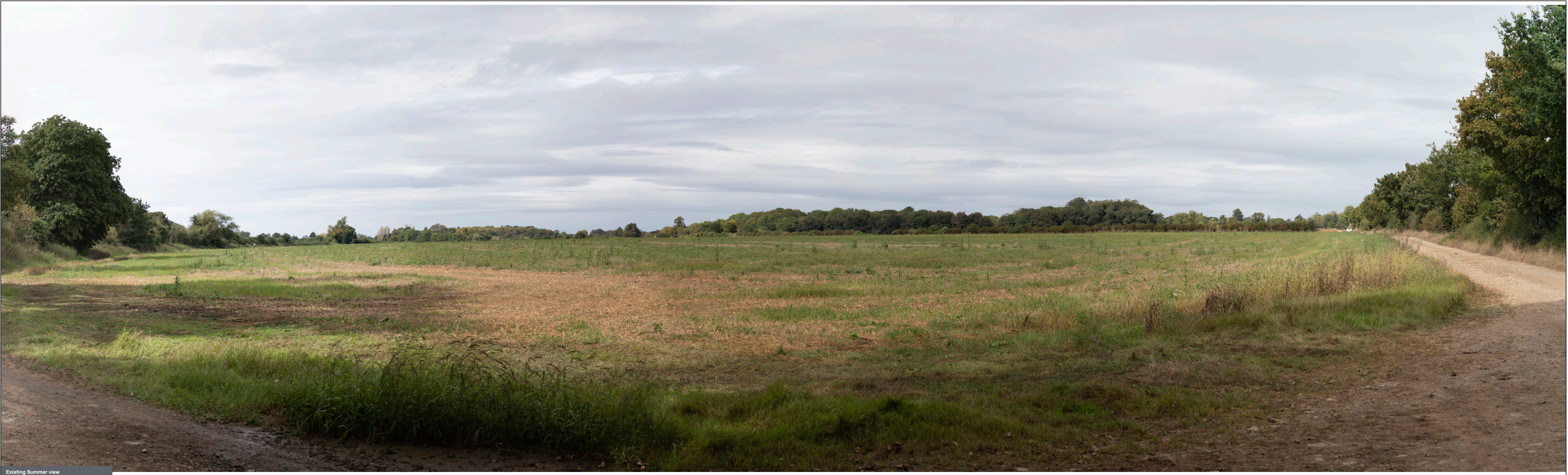
Existing Summer view