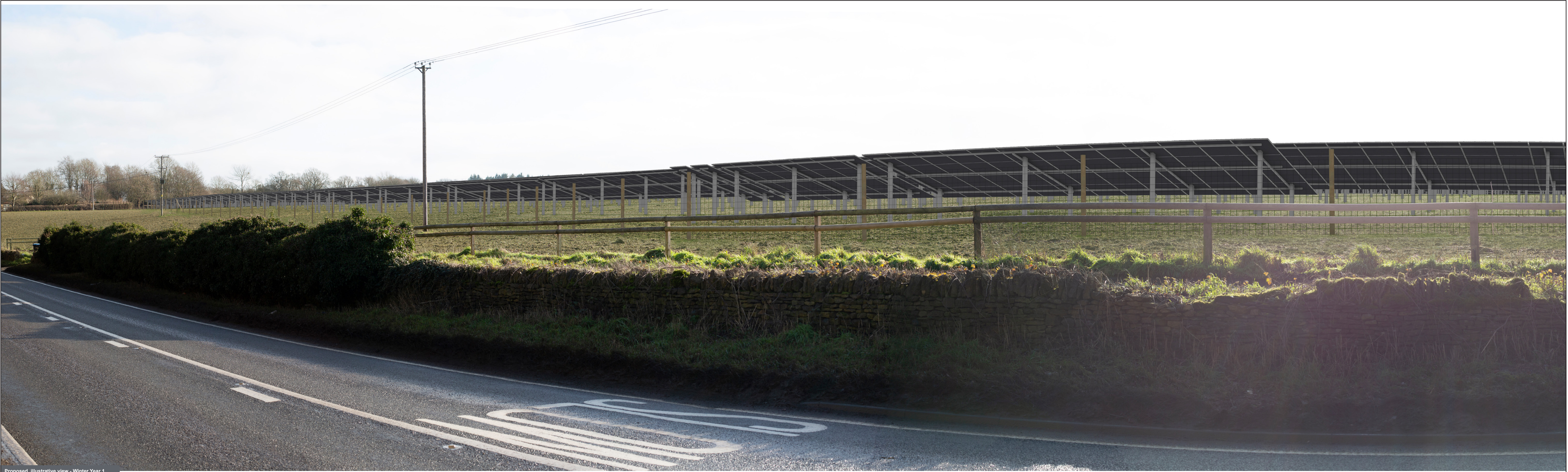
Proposed illustrative view - Winter Year 1