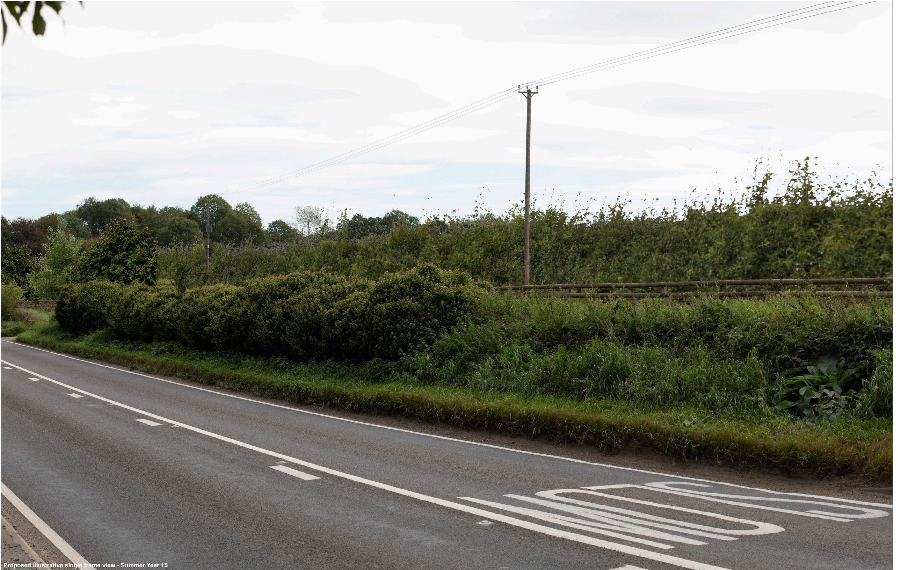
Proposed illustrative single frame view - Summer Year 15