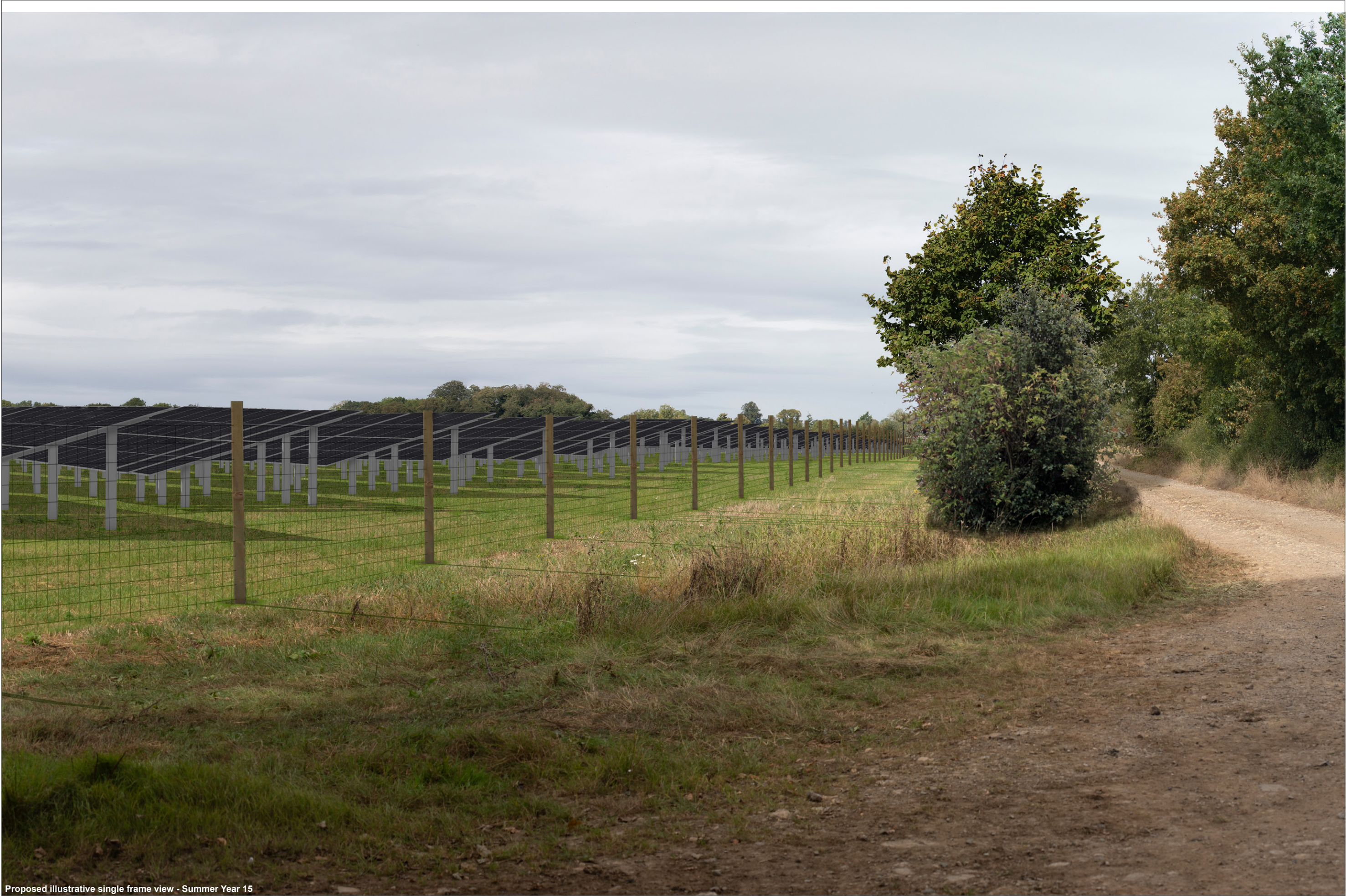
Proposed illustrative single frame view - Summer Year 15