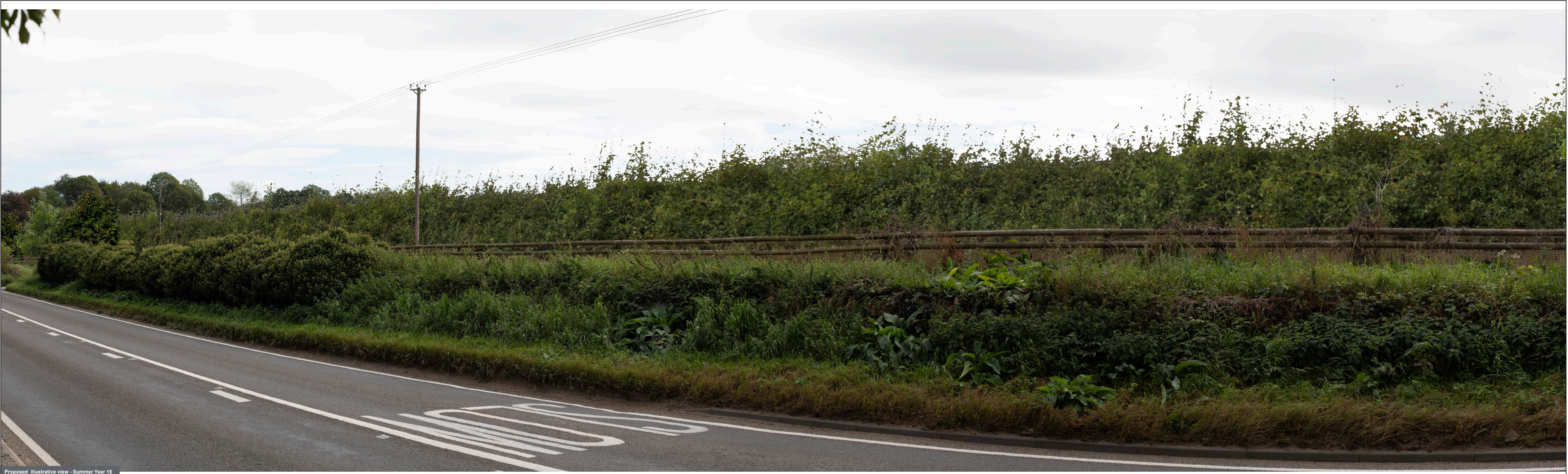
Proposed illustrative view - Summer Year 15